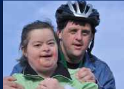
Special Needs Adults